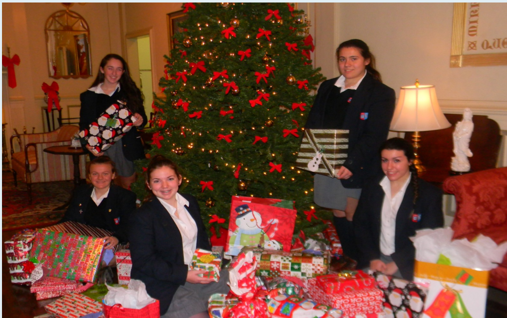
SDA Giving Tree