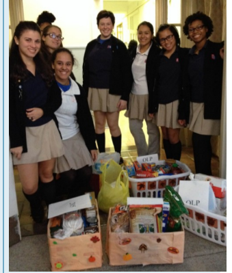
The annual DYAC Thanksgiving drive collected baskets of food for 17 families - complete with turkeys!

In early February, the club conducted their annual Souper Bowl, collecting canned goods and winter clothing items to, once again, help the less fortunate in the Jersey City community. All items were donated to the Our Lady of Sorrows Emergency Food Pantry in Jersey City.