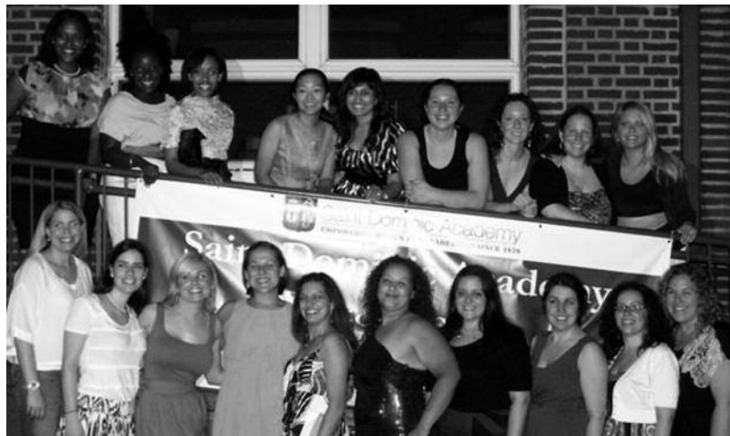
On June 18, the Class of 2001 returned to the Academy to celebrate 10 years of friendship.