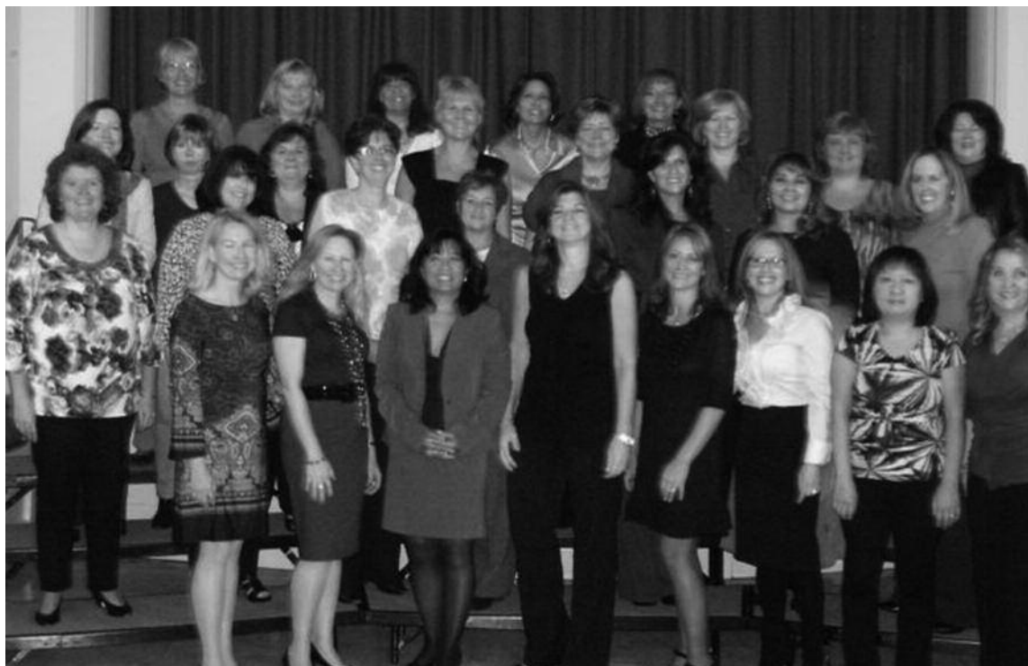
The Class of 1980 celebrated their 30th reunion at the Academy.